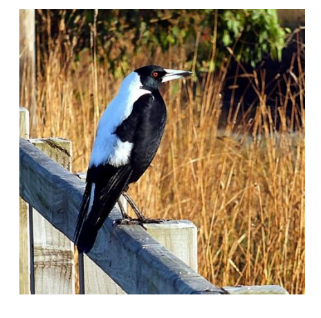
Magpie Familiar black and white bird. Males have a white back, females are grey.