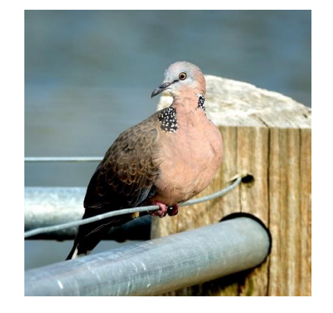
Spotted Dove Grey-brown and pink with a black band spotted white around the neck