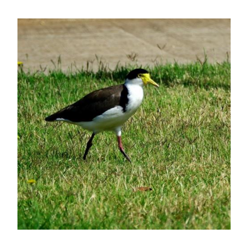
Lapwing Brown back, white front, yellow bill and face shield. Nests on open ground.