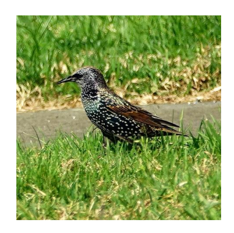
Starling A black bird with white speckles. All black in summer with a yellow bill.