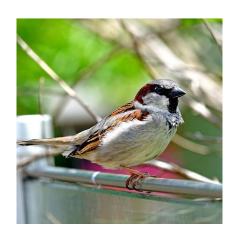
Sparrow Small bird often around shops, farms, picnic grounds, etc.