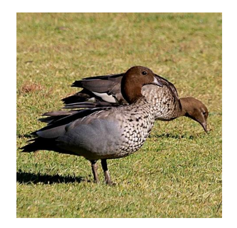
Wood Duck A brown and grey duck that eats grass. Only seeks water if threatened.

Many birds have learnt to live with us. They use our parks and gardens and happily survive in our streets. You may find many of these birds in Civic Park, Balmoral Park or even your own backyard.